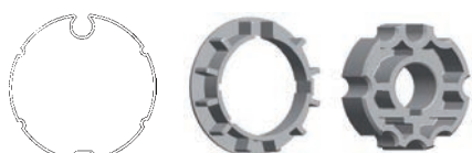
Ø85 x 1,5 mm Corona e ruota / Crown and wheel