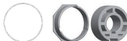
Ø70 x 1,5 mm Corona e ruota / Crown and wheel