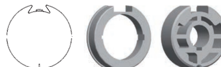
LP Ø89 x 1 mm Corona e ruota / Crown and wheel