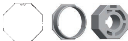
Ø70 x 1,5 mm Corona e ruota / Crown and wheel