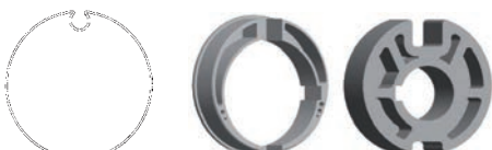
Ø78 x 1,5 mm Corona e ruota / Crown and wheel