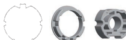
Ø80 x 1/1,2 mm Corona e ruota / Crown and wheel